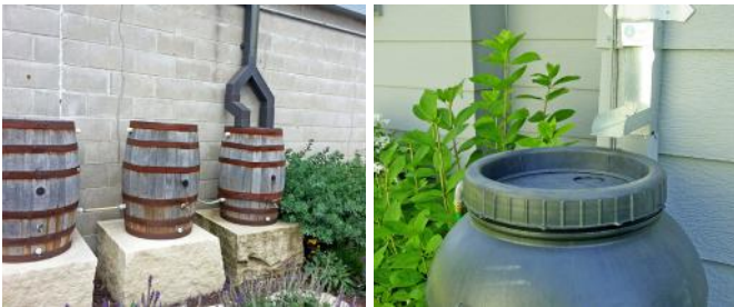
Left: Connected rain barrels capture more water for reuse. Right: A downspout is redirected into a rain barrel.

Rain barrels are placed in locations that can easily catch water such as at the end of a downspout. Using downspout adaptors or flexible elbows, rain barrels are placed at the end of downspouts that are directed to the top of the barrel. Rain barrels will fill quickly and will require an overflow drain for excess water. The overflow drain can be a garden hose or outlet pipe pointed away from the house or connected to another barrel to increase storage capacity.