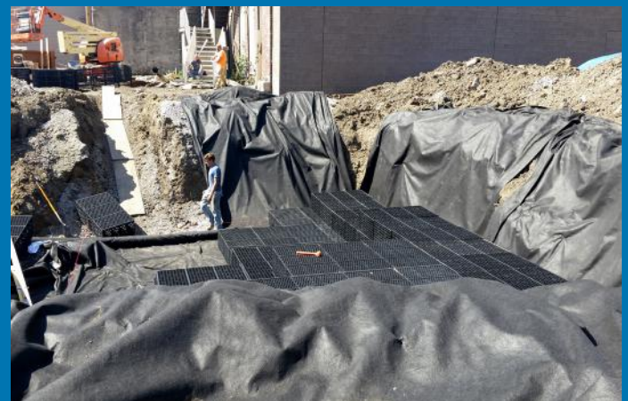
These structural blocks and plastic liner are used to store water below ground. They are used as the reservoir below natural or landscaped water features, like shown above and on the front page.