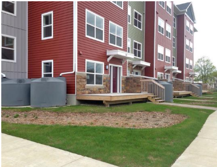
Above ground rainwater harvesting cisterns in Cedar Rapids capture water to be used for gardening and irrigation.