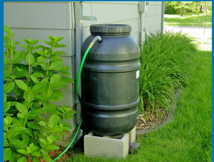
Rain barrel capturing rainfall from homeowner's roof to be used for watering plants.